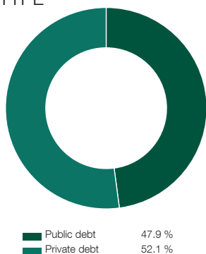
Source of data: UBP