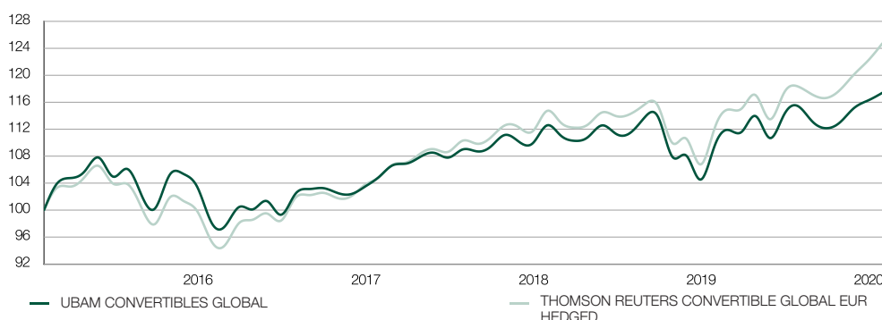
Performance over 5 years or since inception. Source of data: UBP. Exchange rate fluctuations can have a positive or a negative impact on performance. Past performance is not a reliable indicator of future results. The value of investments can fall as well as rise.