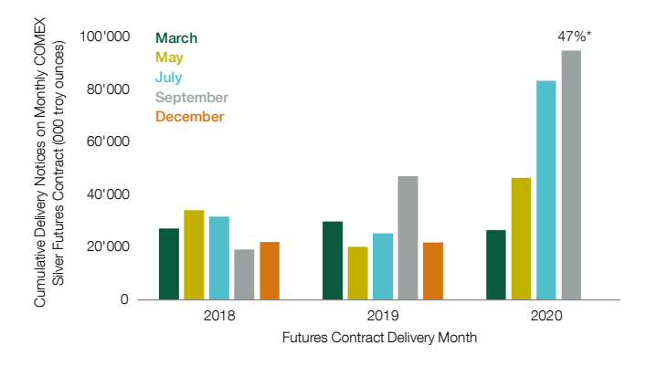
* % of eligible inventory assuming 14% of contract open interest stands for delivery as in July 2020

A growing demand for physical delivery is straining COMEX inventories in gold and silver